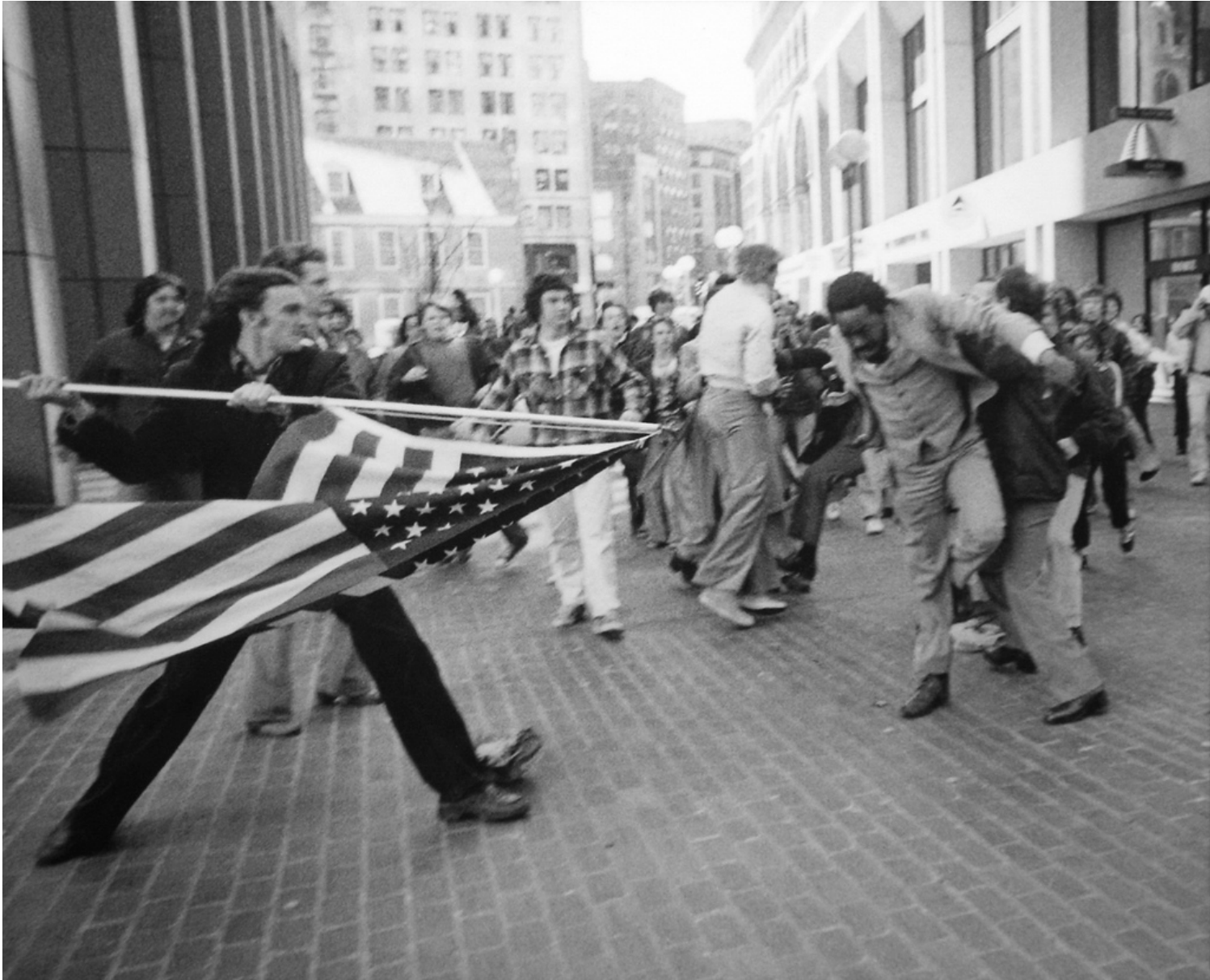
“The Soiling of Old Glory” by Stanley J. Forman 1977 Pulitzer Prize for Spot Photography