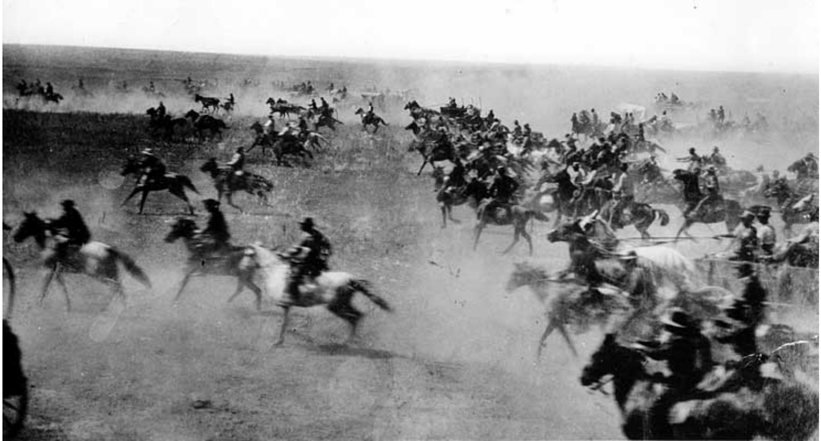
Oklahoma Land Rush of 1889